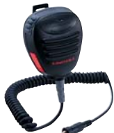
Submersible Mic Plug