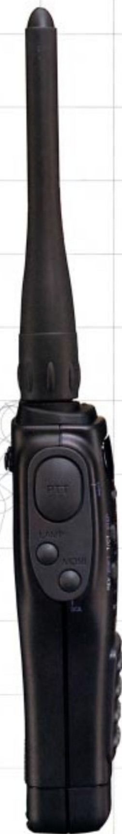
TH-22AT (side view)