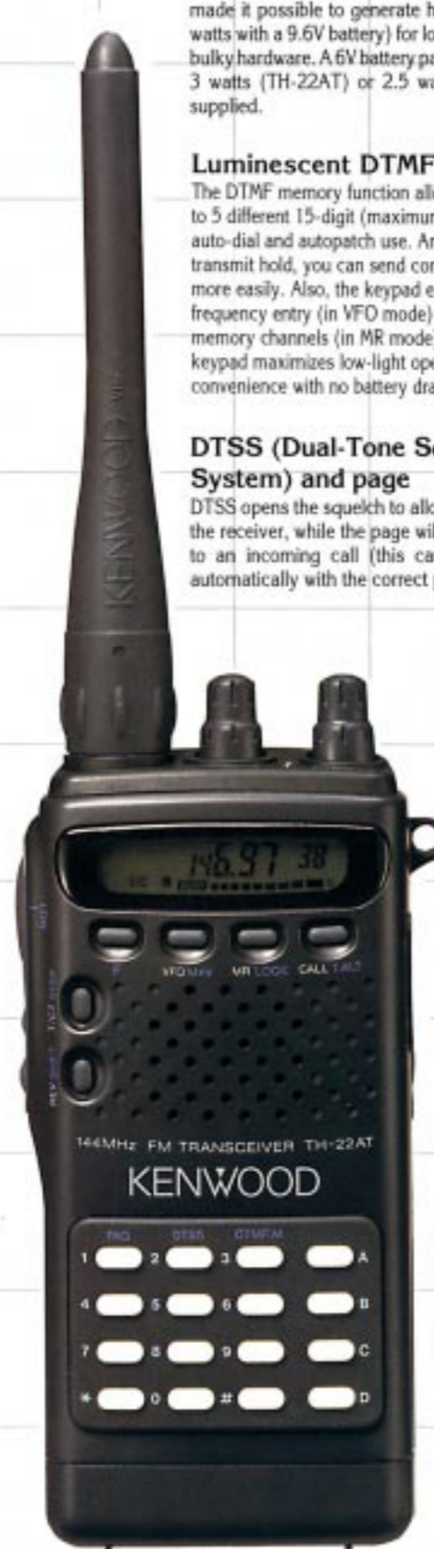
TH-22AT (actual size)